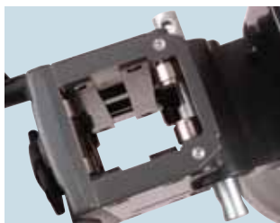
High accuracy drilling is possible by lightly moving of feeding handle.