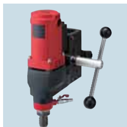
Drill Carriage Assy is already assembled.