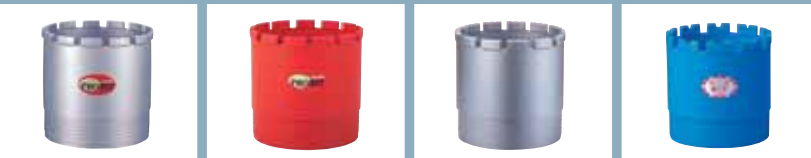
Three separated core bit : Bit, Tube and Coupling.