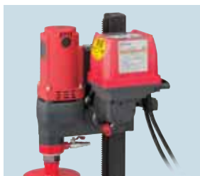
Automatic Feeding System EHAC can be installed.