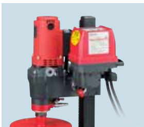
Automatic Feeding System EHAC can be installed.