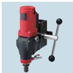
Drill Carriage Assy is already assembled.